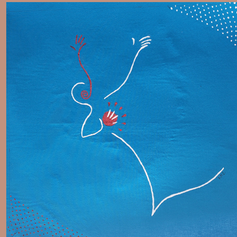
The Soleá Project